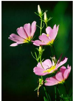
The Plymouth Gentian is a threatened species and can be found on the edges of Coles Pond